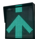
Single unit incl. sun screen