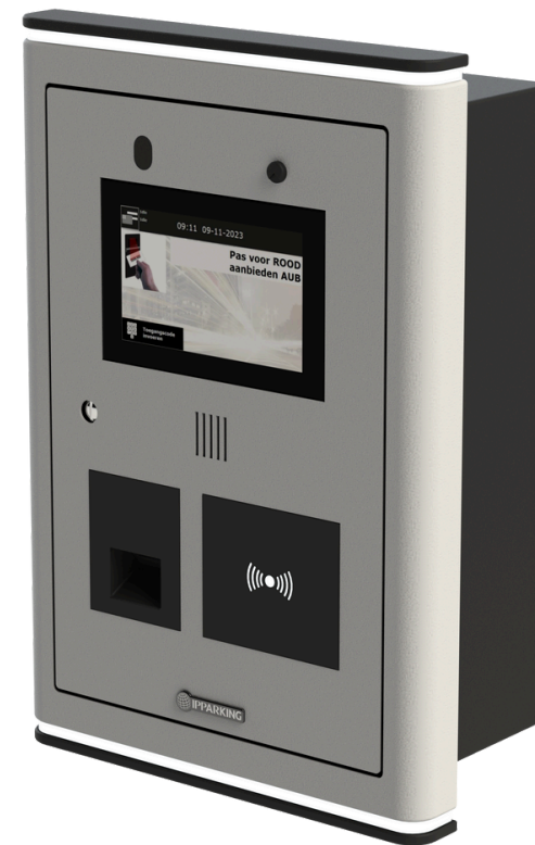
Semi flush | Wall mount